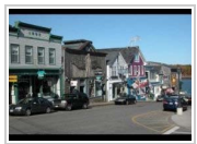
What to Do in Bar Harbor This Summer